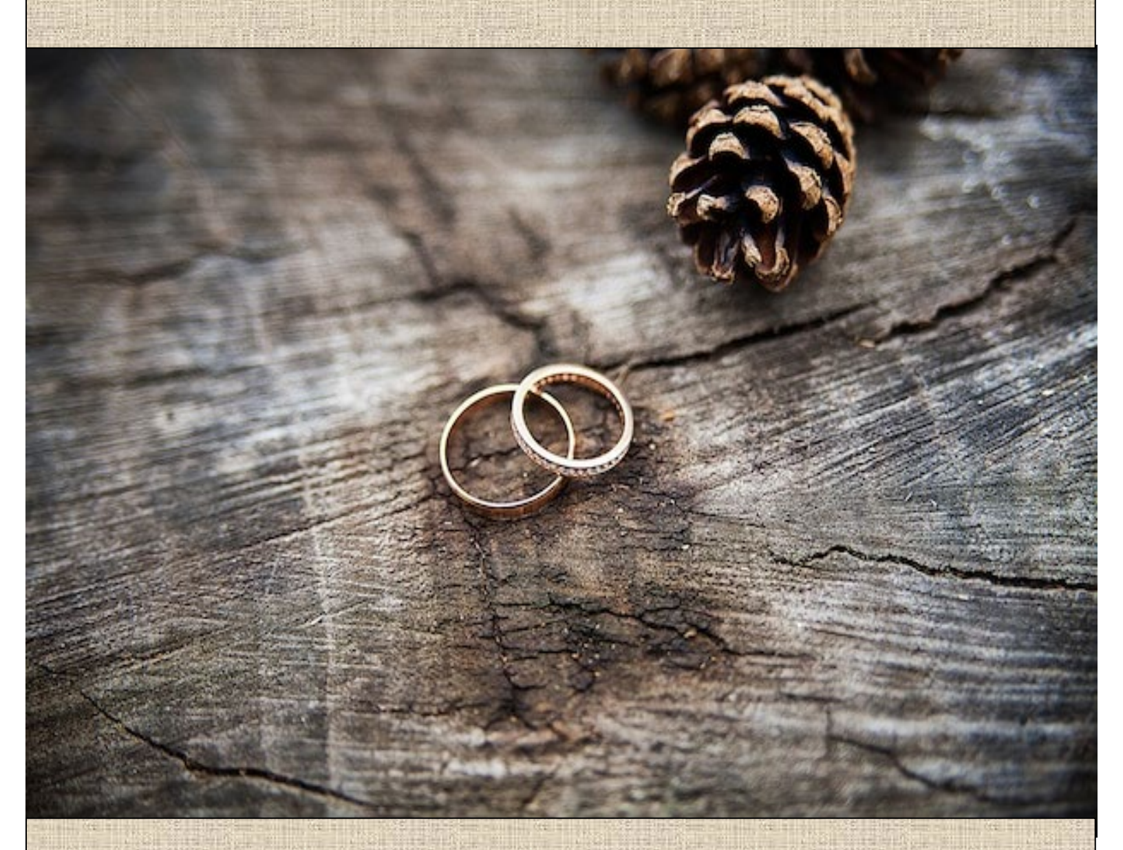
The Corporation of the Municipality of Temagami